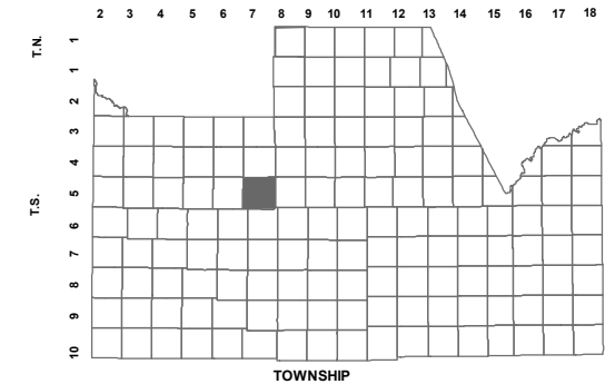
LOCATION MAPS R.E.