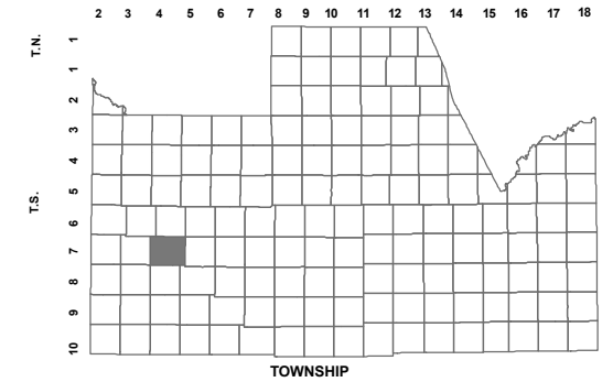
LOCATION MAPS R.E.